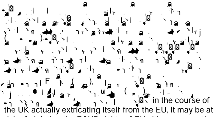
risk of violating the ECHR rights of EU citizens currently living in the UK.<sup>3</sup>

how human rights in Britain may be affected by Brexit the future of the UK's position as a signatory to the European Convention on Human Rights (ECHR) issues of human rights and devolution.